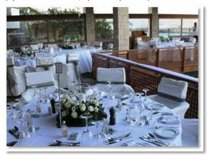
Yacht Club Restaurant

at porto elounda GOLF & SPA RESORT (open air restaurant, up to 120 persons)