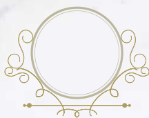
PLATE SERVICE MENU EROS MENU