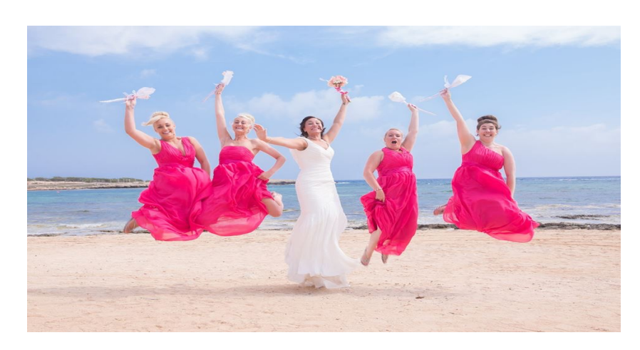
To love and be loved is to feel the sun from both sides

web: MyCyprusWed.com | email: weddings@tsokkos.com