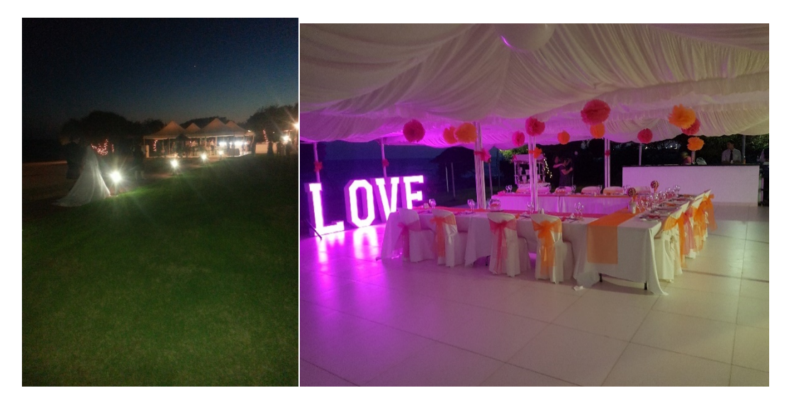
***Please note the Love lights/decorations are not included in the venue fee***