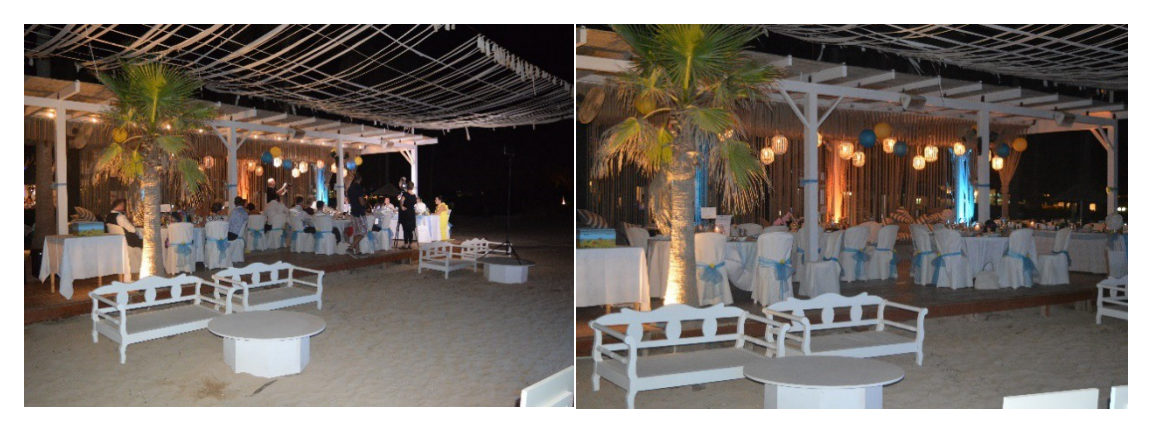
***Please note this reception venue is available from 19.00hrs***