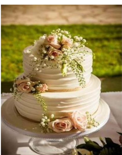
Forest Fruit Cake, Sponge Cake with