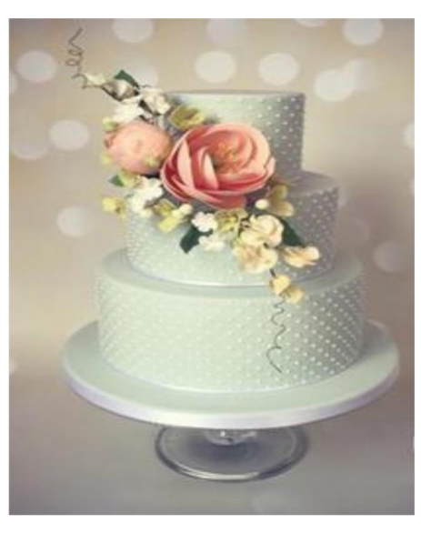
Red & Velvet, with Mascarpone Cream or Lemon Butter Cream €450